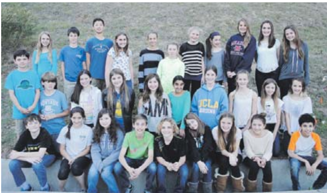
"Disney's Peter Pan Jr." Crocodile Cast at Orinda Intermediate School

Orinda Intermediate School's Bulldog Theater will present its spring musical, "Disney's Peter Pan Jr." in early May at OIS. Based on the Disney film and J.M. Barrie's enchanting play is a modern version of the timeless tale about a boy who wouldn't grow up – with no flying required.